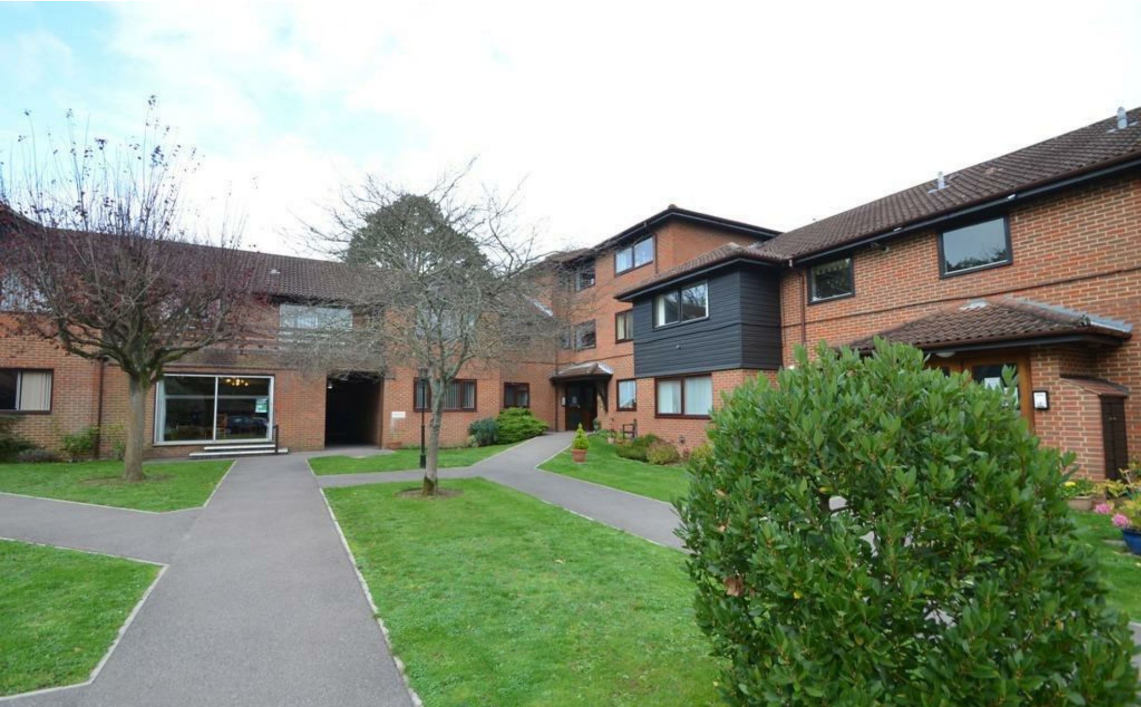
Heathside Court, Tadworth Street, Tadworth